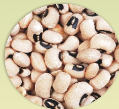
Black Eye Beans