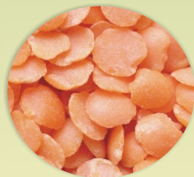
Red Lentils (Whole/Split)