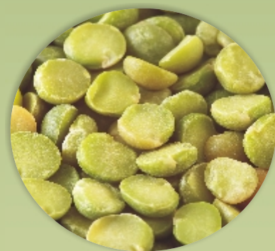
Green Peas (Whole/Split)

GAC supplies peas and lentils to customers around the globe with special focus on the following core products