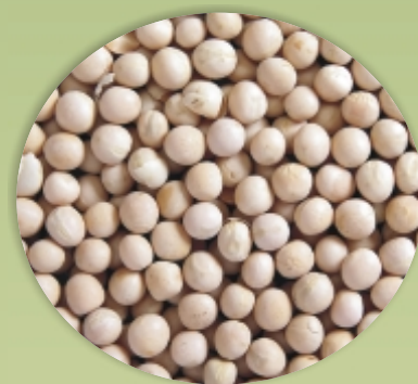
Yellow Peas (Whole/Split)